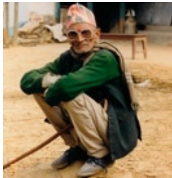
Nepalese man, wearing glasses donated by Rotary

Thanks to our clients who have been donating their old glasses to support Rotary Australia's World Community Service Program.